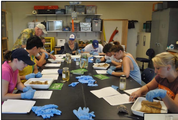
Above: Survey scientists and affiliated KU faculty and staff conduct classes for KU students, K-12 science teachers and other groups at the Field Station's Armitage Education Center. Right: Modern labs at the Field Station support research projects.