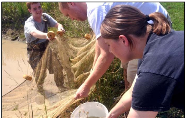
KU student researchers collect fish from an experimental pond at the Field Station.