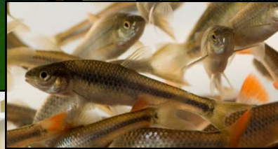
Top: Large fiberglass tanks (mesocosms) facilitate controlled aquatic experiments. Above: Endangered Topeka shiners, a subject of long-term study by Survey scientists.